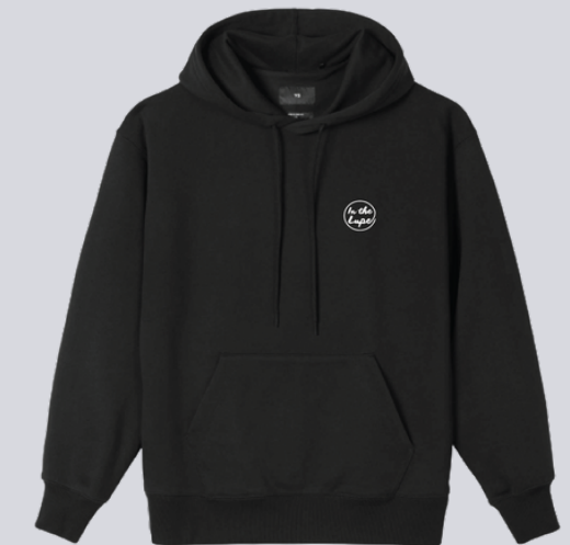
College Originals Hoodie