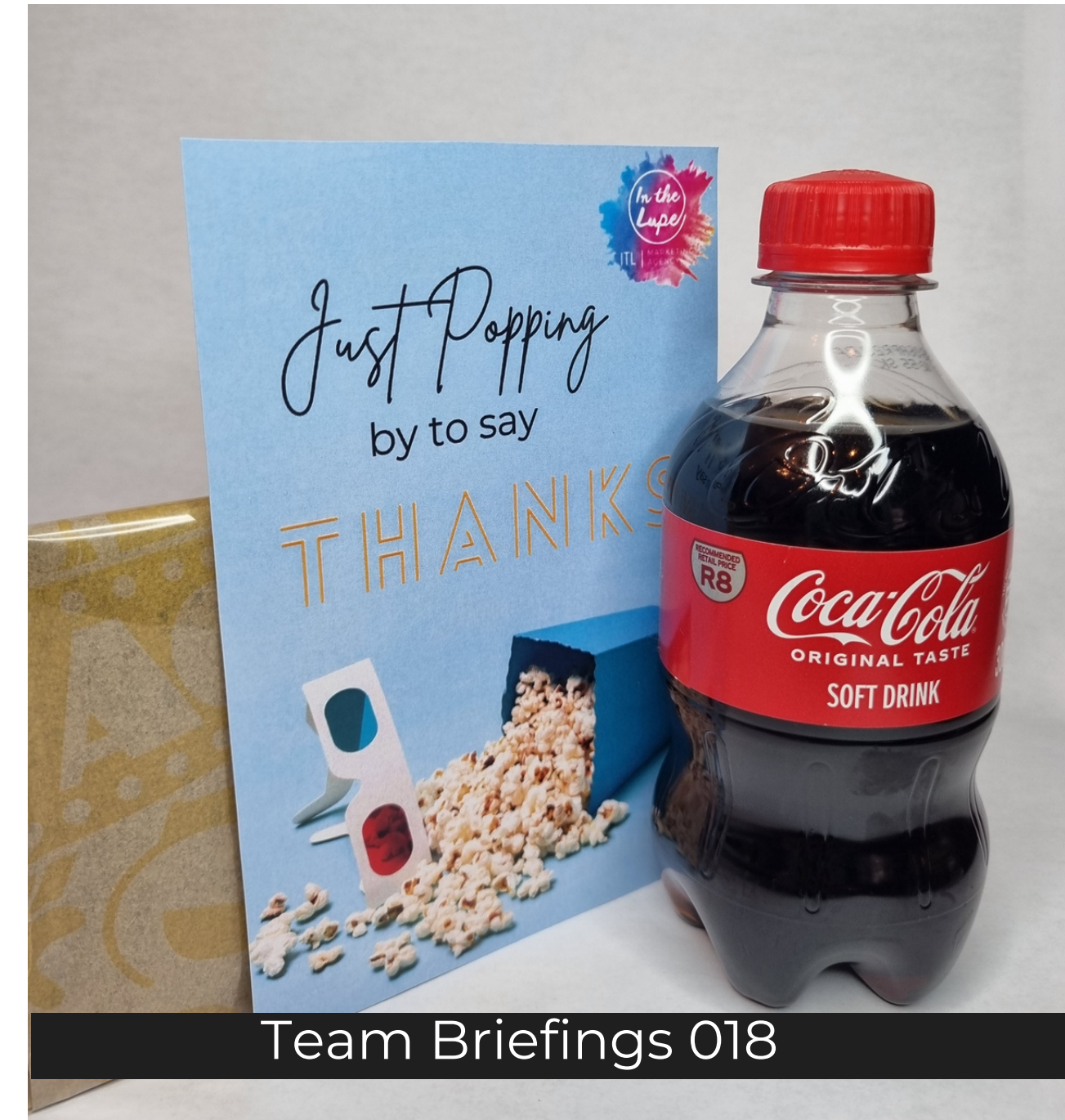
Team Briefings 018