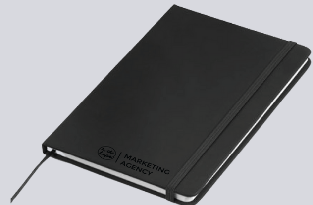
Prominence A5 Notebook