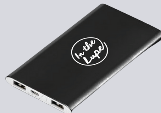
Odeon Slim 4000mAh