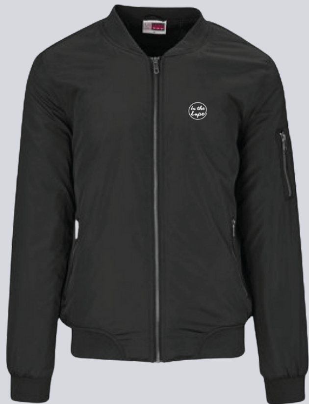
Crusader Bomber Jacket