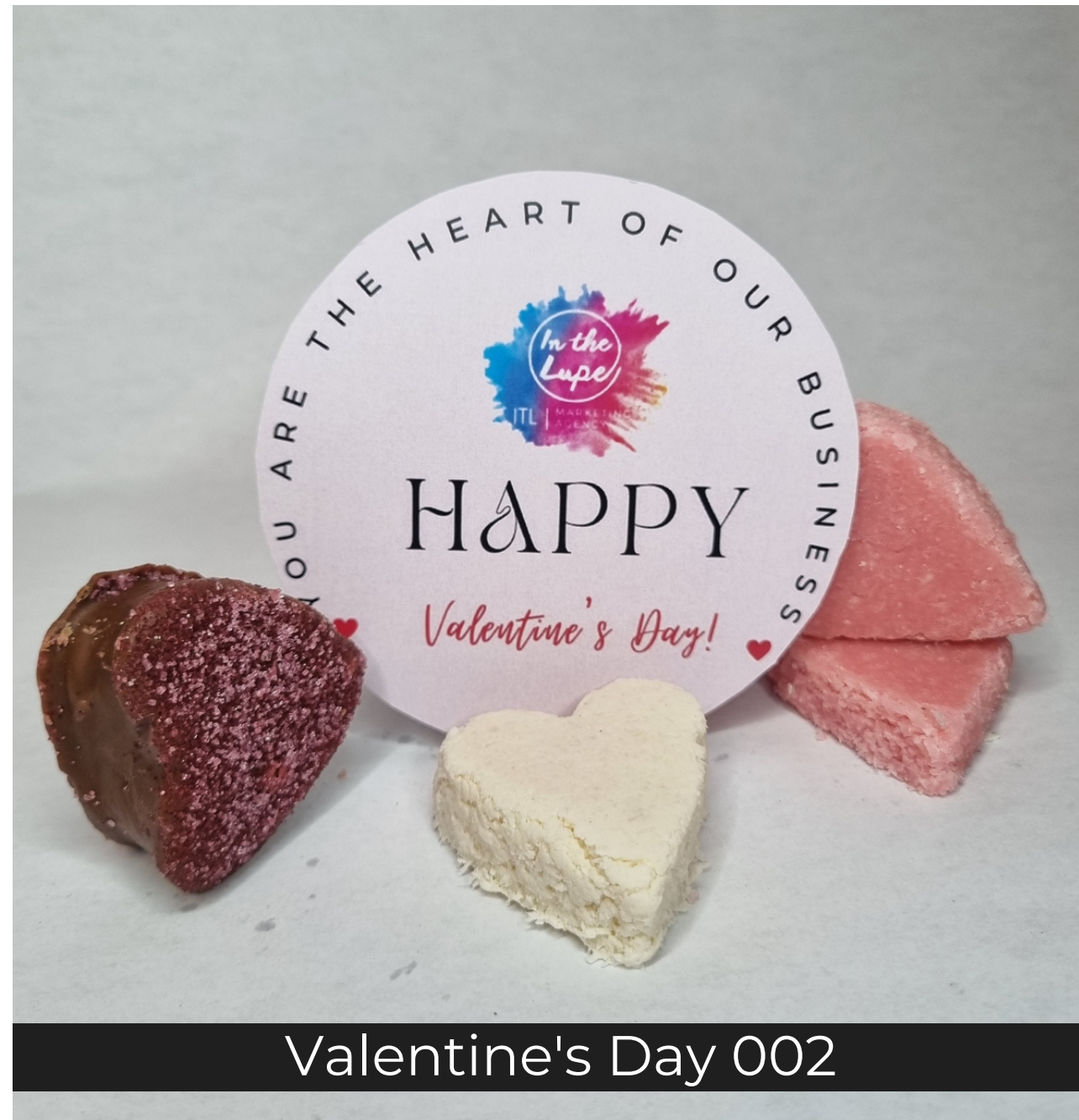
Valentine's Day 002