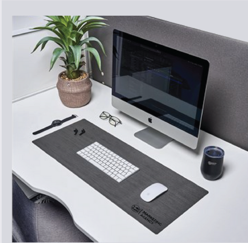
Oakridge Desk Mat