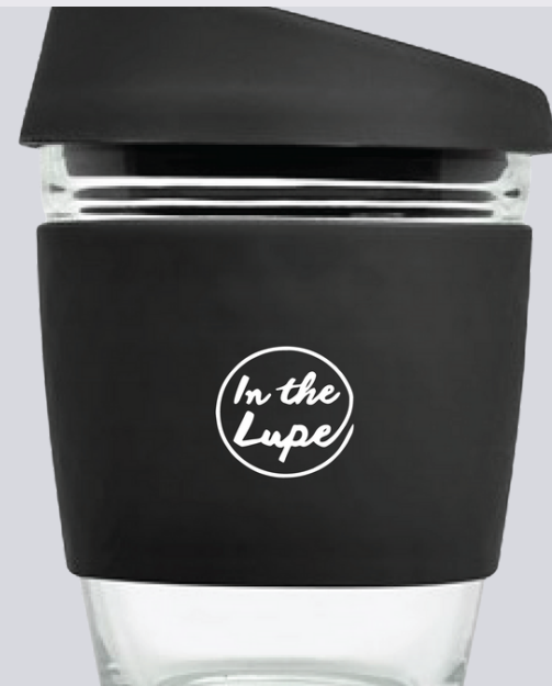
Kooshty Original Glass Kup