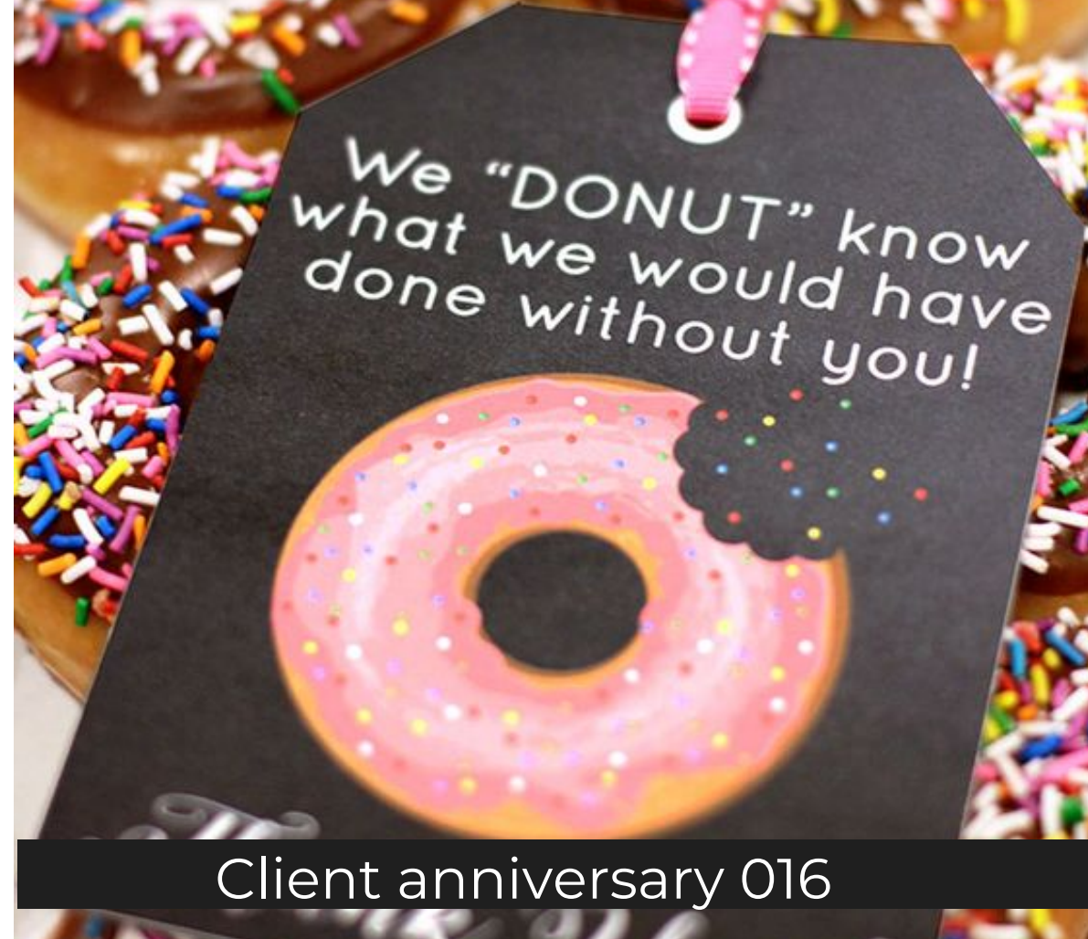
Client anniversary 016