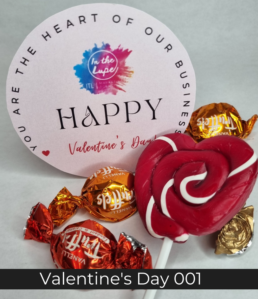
Valentine's Day 001