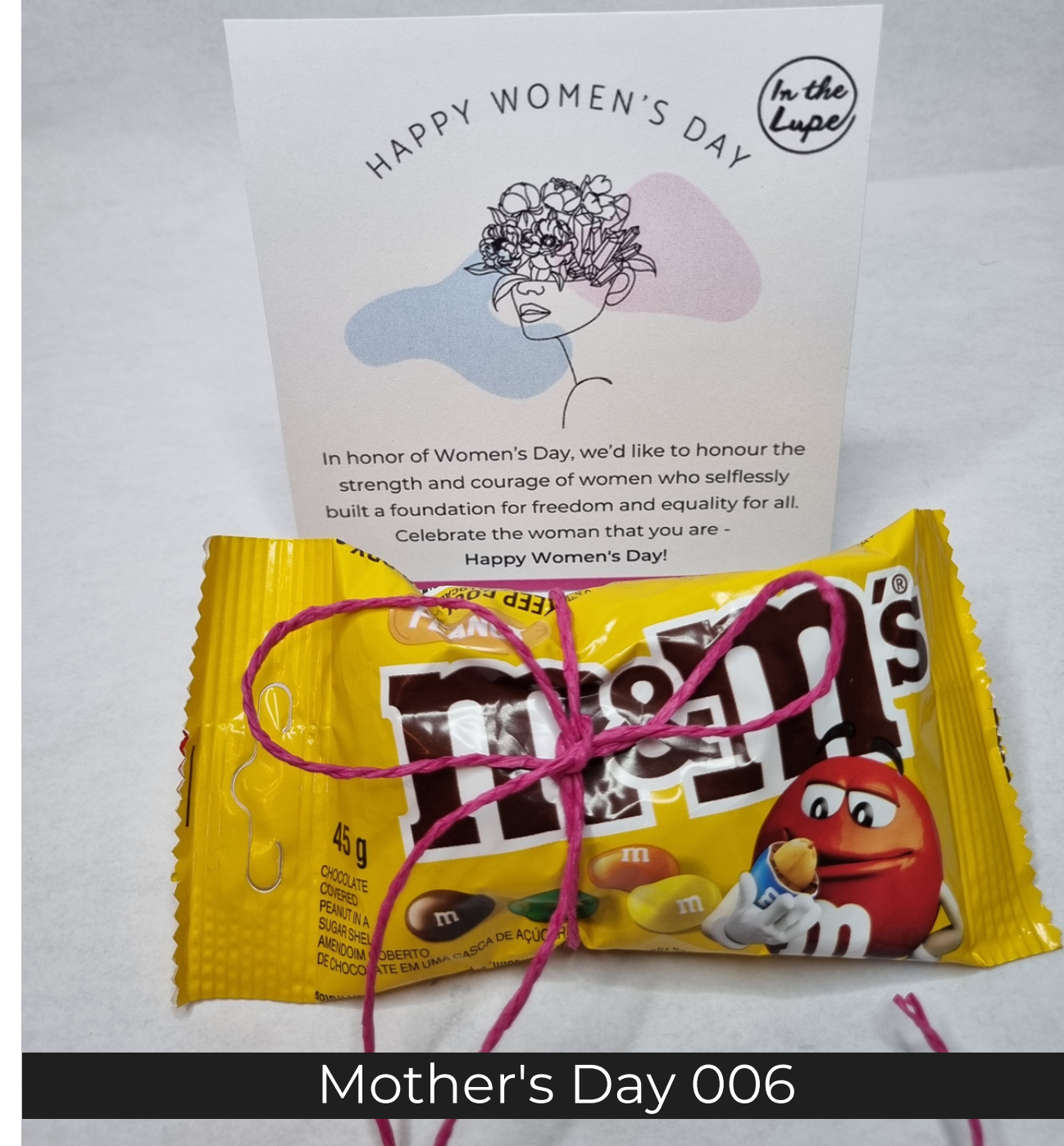
Mother's Day 006