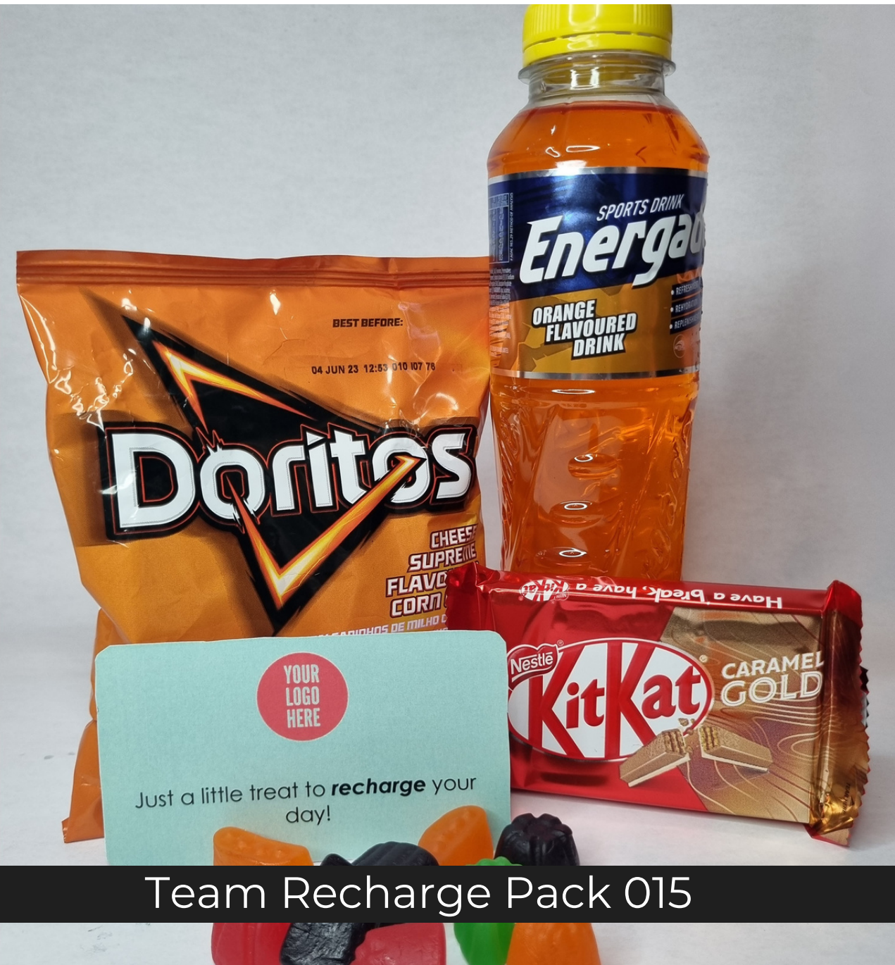
Team Recharge Pack 015