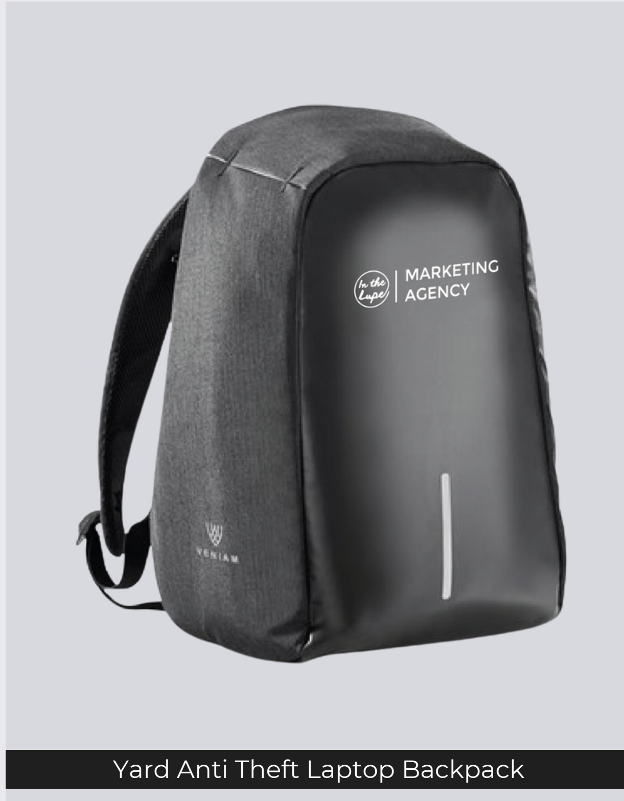
Yard Anti Theft Laptop Backpack