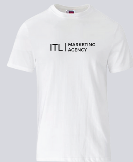
Super Club 180 T-Shirt