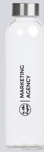
Kooshty Pura Glass Bottle