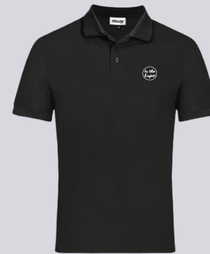
Mens Exhibit Golf Shirt