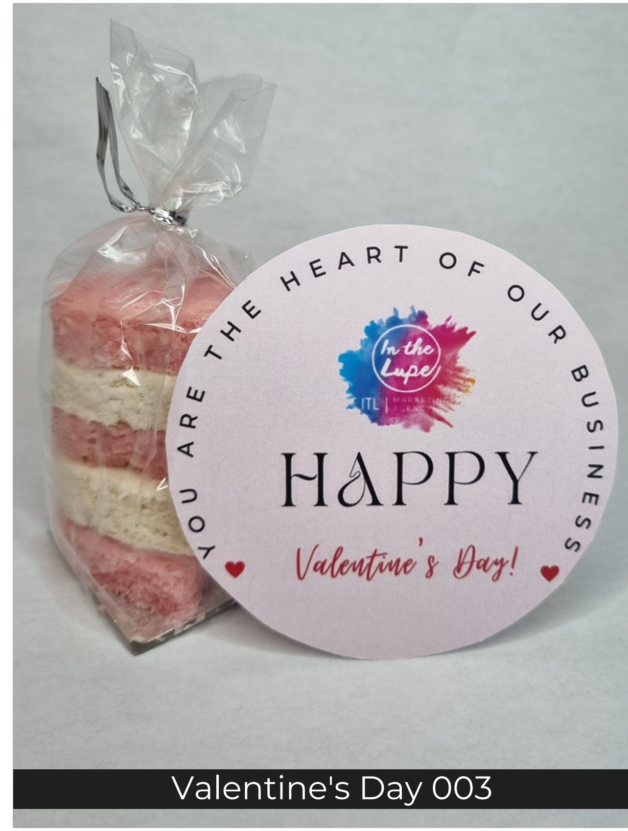
Valentine's Day 003