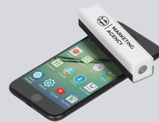
Safe-Guard Phone Sanitiser